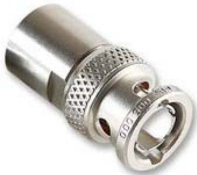
Radial R605 signal output connector (differential with shield)